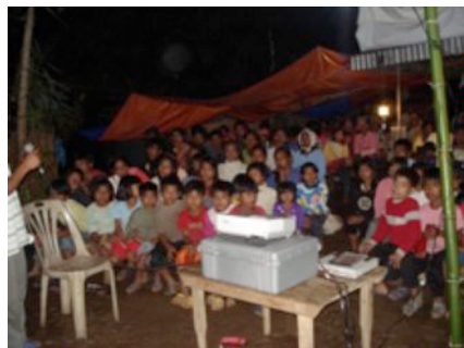
USED DURING FILM SHOWINGS