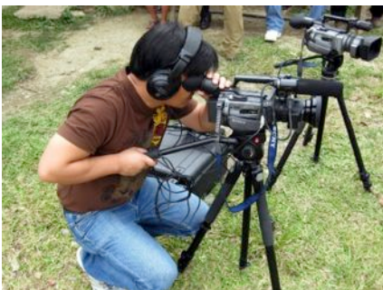
USED DURING PRODUCTION