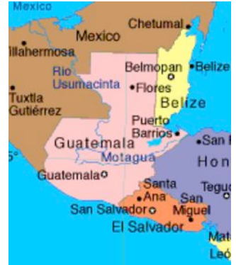
MAP SHOWING GUATEMALA