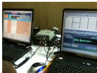
LEFT - THE ILMAV STAFF ABOVE - ILMAV COMPUTERS

HELP ILMAV AND THE INDIGENOUS SOUTH AMERICAN CHURCH BY SPONSORING ALL OR PART OF THIS $7,000 PROJECT ($3500 PER COMPUTER UNIT)