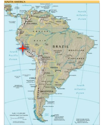
MAP SHOWING SOUTH AMERICA AND ILMAV HEADQUARTERS LOCATION (STAR) IN LIMA, PERU

This project will provide funding for the in country purchase of two (2) new Apple iMac computers. These tools are needed for the continuation and expansion of ILMAV’s ministry. The proposed computers will have as much memory, computing power, and production stability as is currently available, which should allow ILMAV to get in sync with the cameras, software, and other tools involved in producing quality media.