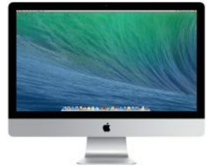
AN IMAC COMPUTER