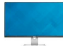
PC Tower and Monitor