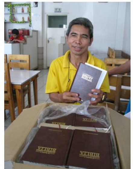
A FILIPINO EVANGELIST EXCITED TO HAVE BIBLES TO SHARE WITH HIS PEOPLE

HELP VVM-I AND VVM-CMI CONQUER THE PHILIPPINES FOR CHRIST BY GIVING TOWARDS THIS PROJECT!