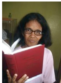
ABOVE – MANY OLDER PEOPLE CAN'T SEE TO READ BECAUSE OF WEAK EYES, SO THE VVM-CMI ALSO ASSISTS BIBLE RECIPIENTS WITH LOW-COST READING GLASSES THROUGH THIS PROJECT SINCE IT DOESN'T DO ANY GOOD TO HAVE A BIBLE IF ONE CAN'T SEE THE WORDS!

IMAGINE HOW MANY SOULS CAN BE PROVIDED THE ETERNAL WORD THROUGH YOUR PARTNERSHIP WITH VVM-I AND VVM-CMI!